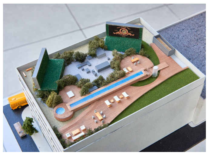
Under construction is the "Garden in the Sky," which includes a pool, spa, jogging track, community deck, and open-air theater.