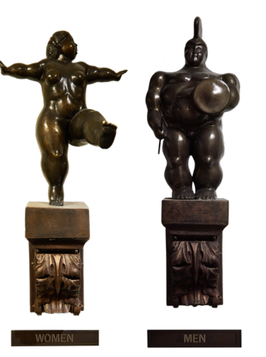
Distinctive restroom signs.