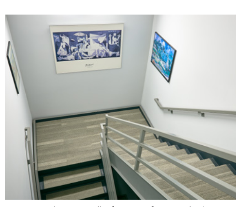
Carpeted stairwells for comfort and silence.