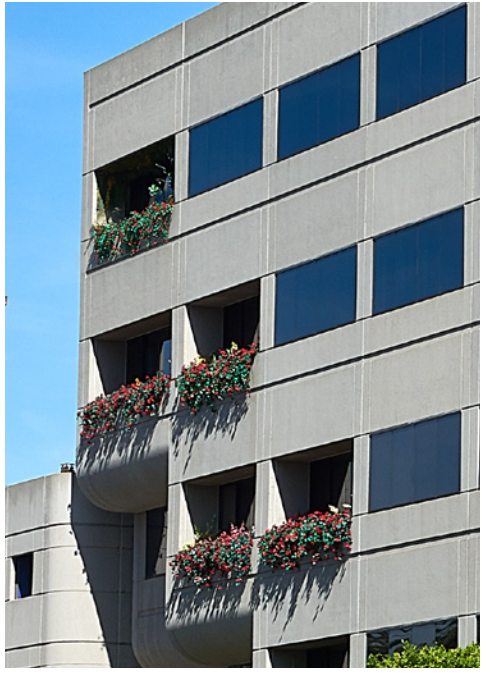
Unusual offices with adjacent flower balconies enhance work/life quality.