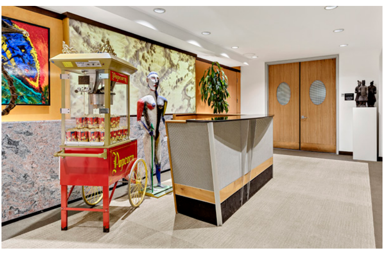
Third-floor elevator lobby