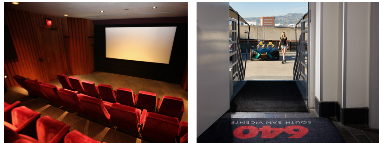
High-tech screening rooms, sound stages, and post-production facilities are also available.