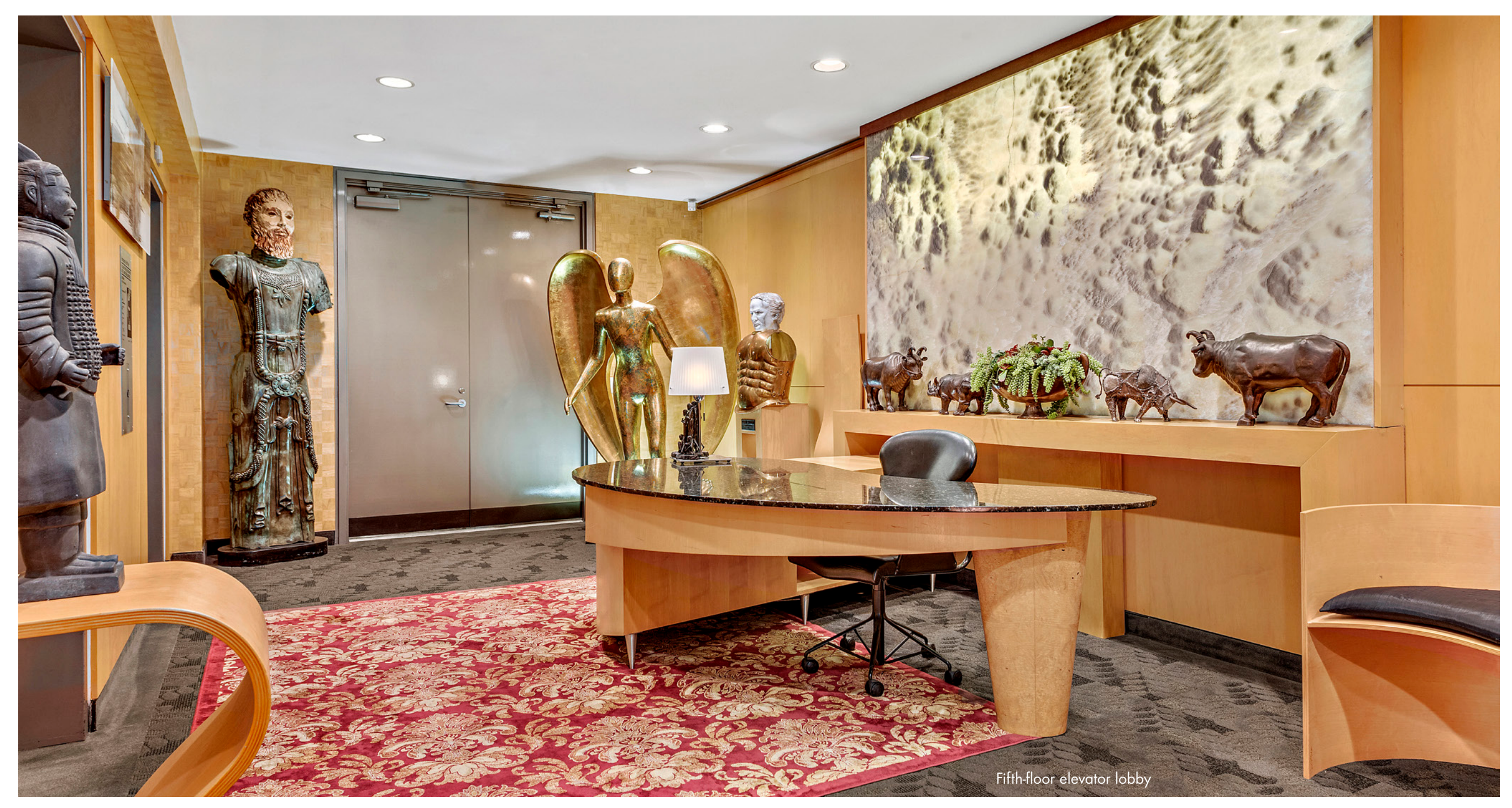
With carefully chosen, museum-quality art a standard throughout the building, no two elevator lobbies are alike.