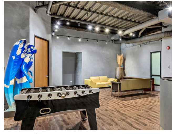
Embassy-level decor is found throughout the building's common areas.