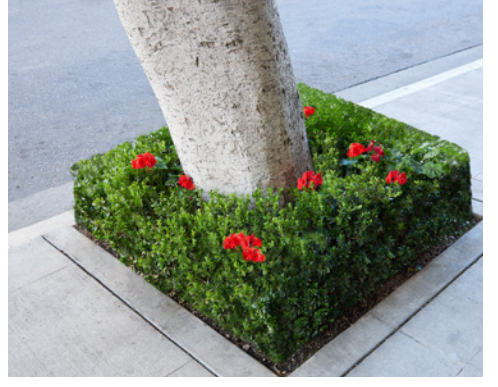
Manicured trees and flowers enhance the building's street-level approach.