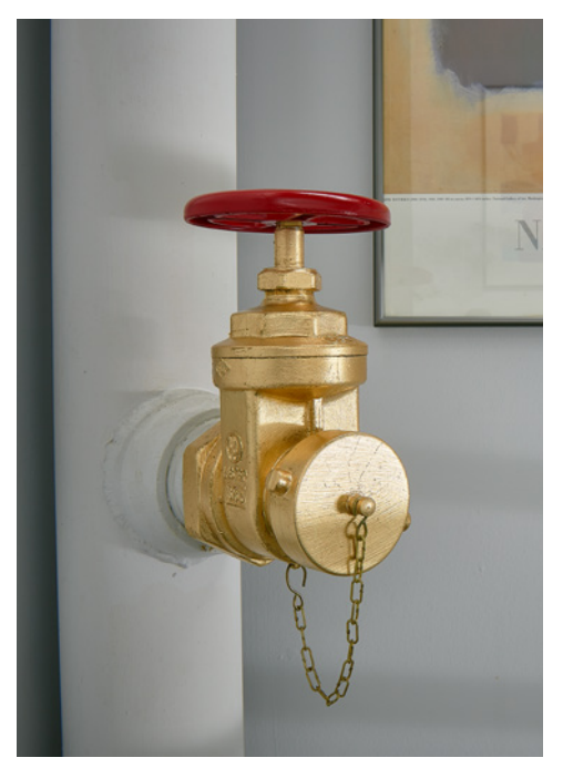
What do the standpipes look like in your previous building?